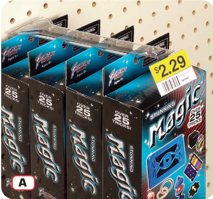
A Holds adhesive labels

Display UPC and pricing information over most metal pegboard hooks with the Hook Hiker™ Label Holder from FFR-DSI. Innovative design clips over pegboard hook and extends the length of the hook to present UPC and price in front of product. Available in two styles, for adhesive and non-adhesive labels.